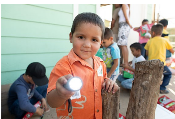
Introducing the Light of the World!