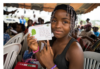
Personal note is a special touch.