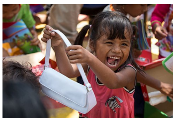
A newfound purse in Cambodia!